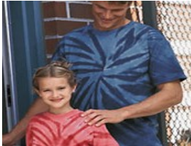
Tie-Dyed T-Shirt 100% Cotton