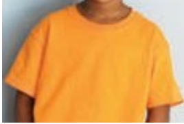
Short Sleeve T-Shirt Pre-shrunk 100% Cotton