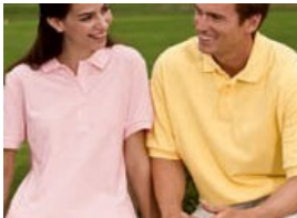
Adult Polo 100% Cotton