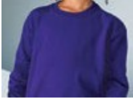
Long Sleeve T-Shirt Pre-shrunk 100% Cotton